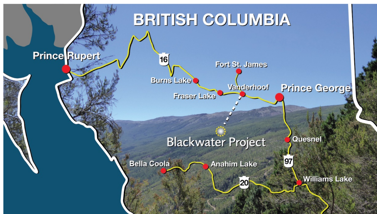
Blackwater Property Location Map

Artemis has a 100% recorded interest in 328 mineral claims covering an area of 148,688 ha distributed among the property and the Capoose, Auro, Key, Parlane and RJK claim blocks. Surface rights over the Blackwater area are controlled by the Crown.