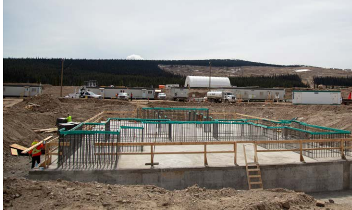
Ball Mill Foundation With Rebar - May 2023

Key mobile construction equipment has been delivered to site, including excavators, backhoe loaders, compactors, grader, telehandlers, and a fuel and lube truck. The earthworks fleet contains approximately 35 individual pieces of equipment.