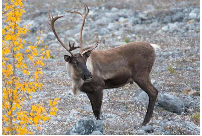
Caribou from the region, not specifically Tweedsmuir Caribou

The $2.7 million in funding will be used for caribou habitat restoration initiatives led by the Lhoosk'uz Dené Nation and the Ulkatcho First Nation. Artemis Gold, the provincial government, the federal government, the Lhoosk'uz Dené Nation and the Ulkatcho First Nation will collaborate on long-term caribou monitoring throughout the region.