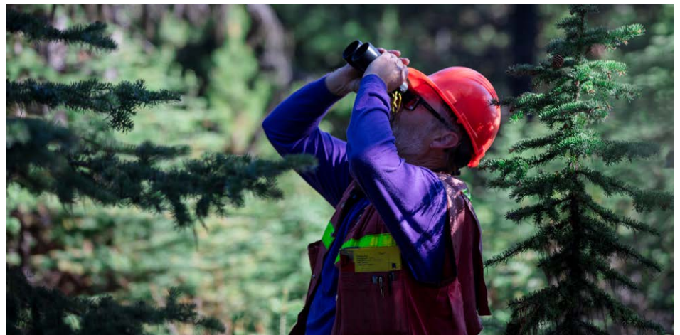
Avison team conducting environmental surveys on site at Blackwater in May 2023

The Blackwater Mine is creating diverse opportunities for local and regional businesses - from supplying materials and equipment to providing repair and maintenance, health, safety, and environmental services. A local natural resources consulting company, Avison Management Services, has been supporting our environmental work at the Blackwater Project for 10 years and has worked in the Vanderhoof area for almost 44 years.