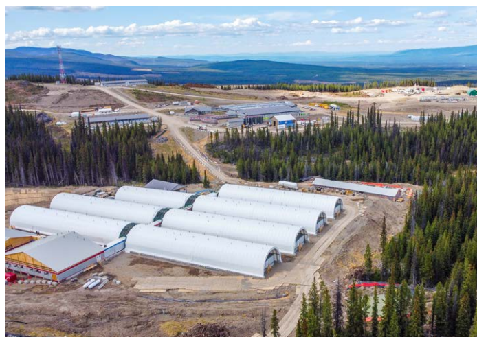
Construction camp - May 2023