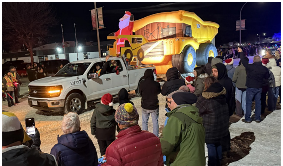
Artemis Gold float in the 2025 Vanderhoof Parade of Lights

Our team was thrilled to help make the 2025 Vanderhoof Parade of Lights the biggest and brightest yet - including more than 40 floats and stretching nearly the circumference of a full city block. Our float featured festive music, glowing lights, and a show stopping inflatable Haul Truck - Santa's biggest load of presents this season.