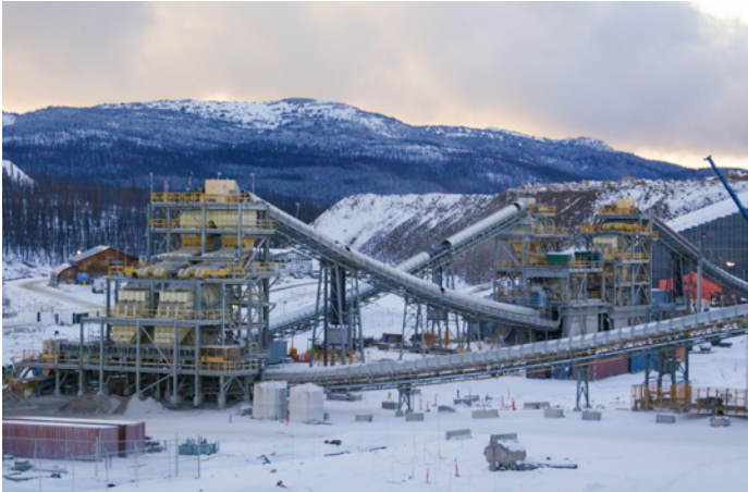
Blackwater Mine crushing circuit, November 2025

On December 15, 2025, we announced an investment decision to proceed with an expanded Phase 2 (EP2) of the mine. EP2 represents a significant addition to processing plant capacity from the previously announced Phase 1A project, which is currently in construction, growing from an expected 8 million tonnes per annum ("Mtpa") before the end of 2026 to 21 Mtpa before the end of 2028.