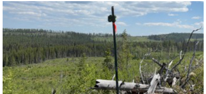
Bat monitoring device at Blackwater Mine

Learn more at: biodiversitypathways.github.io/BWM-NABat2025/