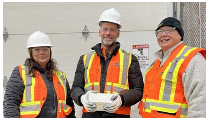
Lhoosk'uz Dené Nation and Ulkatcho First Nation Leadership visit Blackwater Mine, December 2025