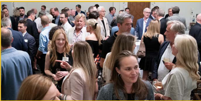
Above: Vancouver Commercial Production Celebration Below: Prince George Commercial Production Celebration