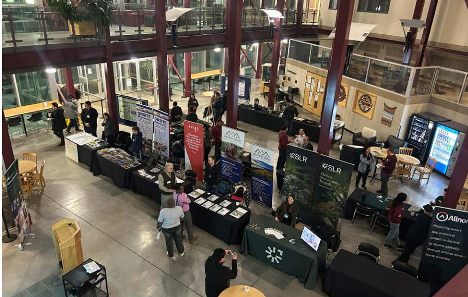
UNBC "Future Outlook of Engineering in BC" event