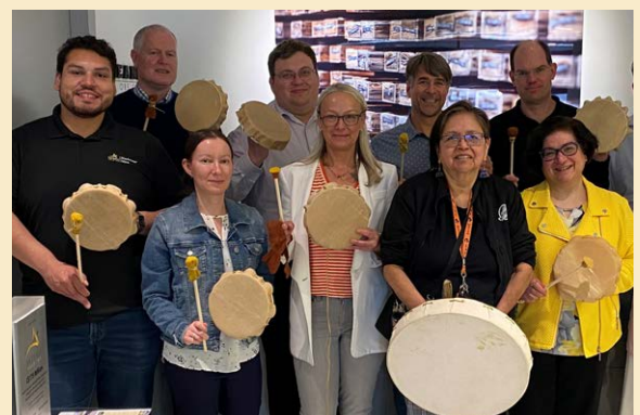
Below: Vancouver employees displaying their drums