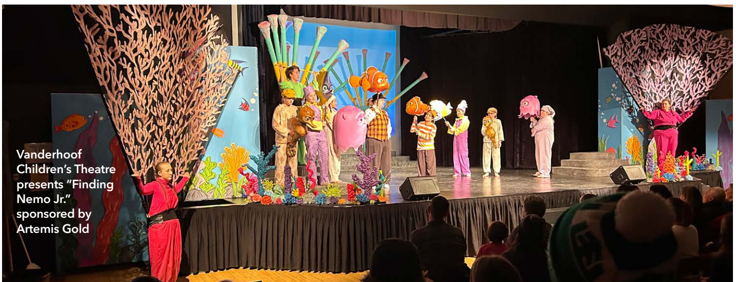
Vanderhoof Children's Theatre presents "Finding Nemo Jr." sponsored by Artemis Gold

We sponsored the Vanderhoof Children's Theatre's production of "Finding Nemo Jr", showcasing the talents of students from grades 2 to 12. The theatre group is known for its inclusive and supportive environment, helping children build confidence and teamwork skills through their involvement in the arts.